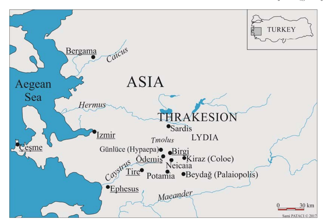
Map 1: The Cayster Valley.

We hope that you will be able to join us at the Dokuz Eylül University, and look forward to seeing you in Izmir! İzmir'e hoşgeldiniz!